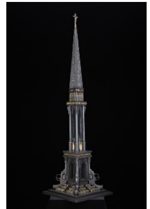
Sculpture by Al Farrow