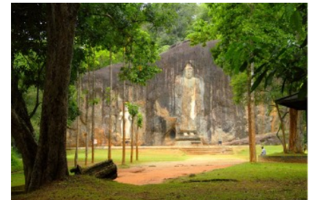
Buduruwagala "Rock of Buddhist Sculpture"