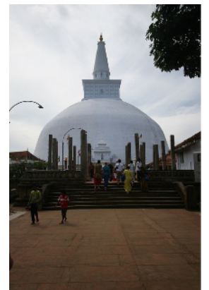
Ruwanwelisaya, Anuradhapura 140 BCE