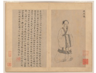
Nine Songs - album, after Zhao Mengfu (MET, 1973.121.15a-p)

Advance registration must be received by SAA by Sept. 1, 2024.