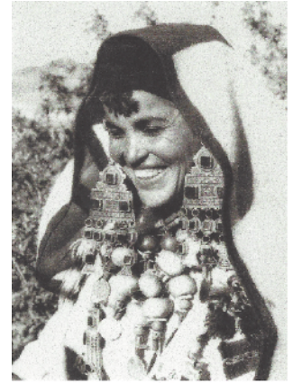
Idaw Nadif woman, Anti-Atlas Region, Morocco 1934-39

Please note that the gallery is on multiple levels and some stairs are involved.