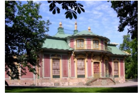
Chinese Pavilion at Drottningholm Palace

We will offer this trip in June via email. This trip is limited to a maximum of 20 SAA members and is expected to fill immediately. If you are not yet a member, you can join online .